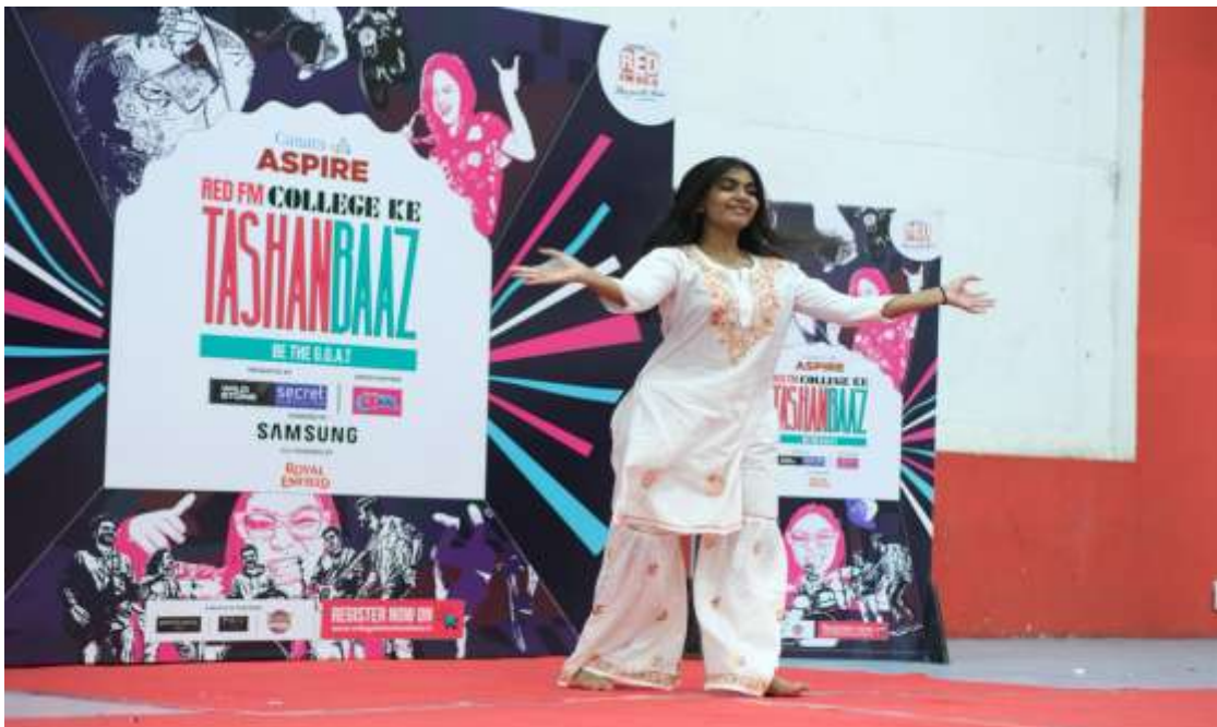
Cultural performances reflecting talent, creativity, and team spirit of the students