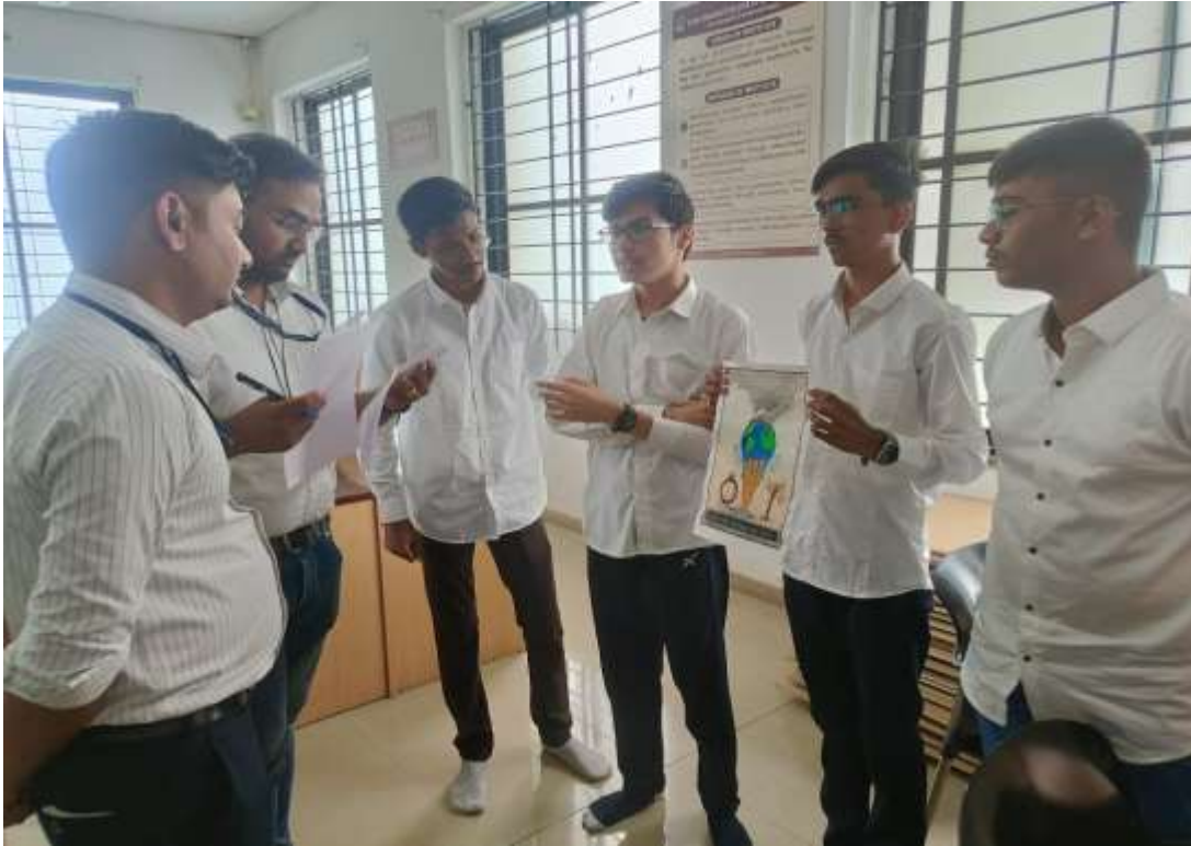
Active involvement of students reflecting enthusiasm and learning spirit throughout the session