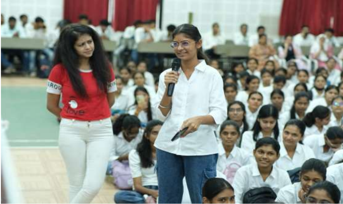
Students showcasing their talent through the cultural program