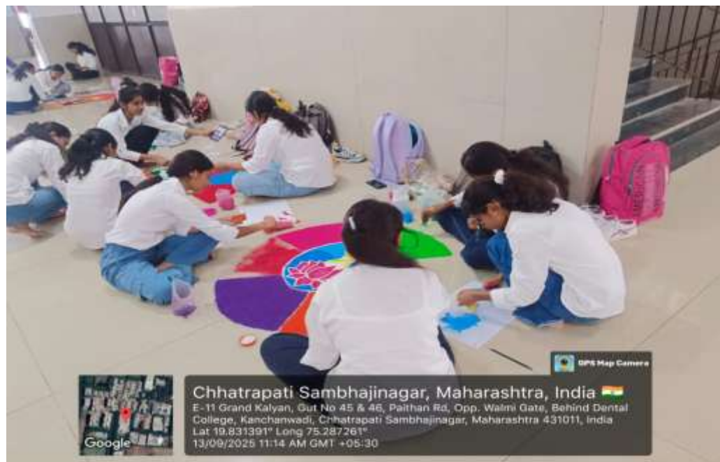
Students expressing social awareness and environmental conservation through rangoli art